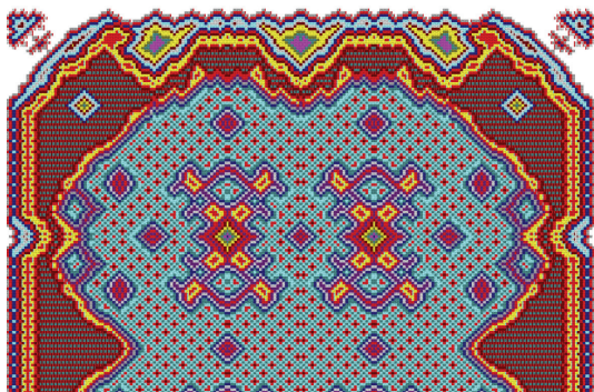
Image credit: Shaheer Zazia, SForEtoE (detail), 2021. Courtesy of the artist.

ALL WORKSHOP FEES INCLUDE MATERIALS AND EQUIPMENT; REGISTRATION IS REQUIRED.