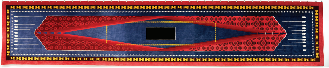
Roda Medhat, Ser-Atah, 2024, Wool carpet, 41x8ft. (panoramic view).

reversing Balsan's presumed authority. Dark and somewhat uncanny, Medhat's sculpture is still able to remain inviting, allowing viewers to consider complex histories beneath the immediate image. Like in all his work, Roda maintains the ability to balance on a fine line between simplicity and incisiveness.